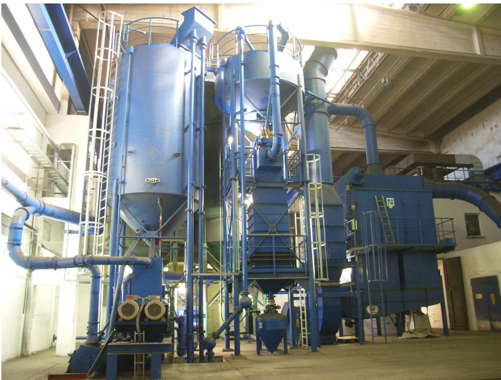
figure 1: mechanical reclamation with a filter plant

The task in most cases includes an entire moulding plant including mixer (figure 1), reclamation and dedusting plant (figure 1).